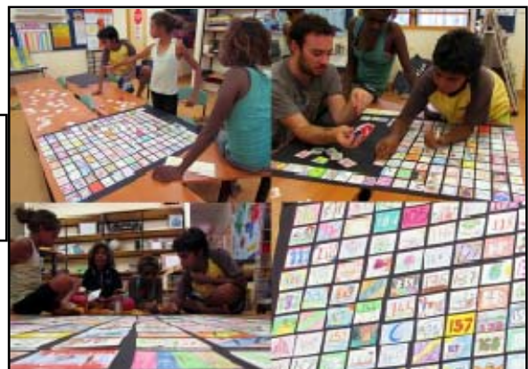
Students making a 1 – 200 chart at Wulungarra

We have finished off all of the Numeration documents ready to have them uploaded by the beginning of next year. As a team we have reviewed the tasks and made some minor changes on the basis of work in the schools. The mathematics and activities sections have been tidied up and professionally edited. We have run a tender process and now have Octane Web Solutions creating the on-line version. During the January PD we will run a workshop on how to use the AICS On-Line version and include a session on using it to plan for the first few weeks work.