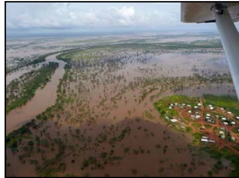
Water surrounding Noonkanbah