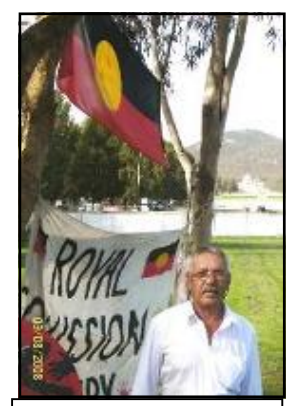
Roland at the site of the Aboriginal Tent Embassy

The delegates were "passionate" advocates and told Minister Garrett about some of the great things happening in AICS. They also presented the Minister with lots of documentation demonstrating the vibrant and successful nature of the AIC group of schools.