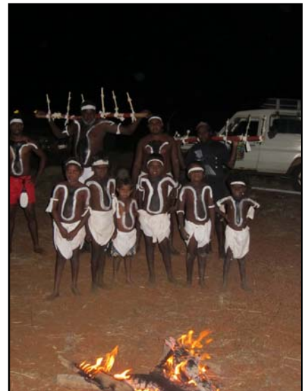
Dancers at Mangunampi

The rhythm of the dancers, the sounds of the clapping sticks, and the voices of the singers echoing across the night reaffirmed that Mangunampi was, is, and will always be Walmajarri Country.