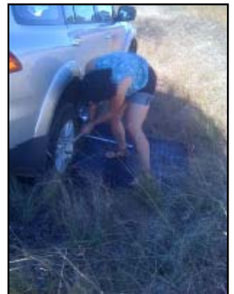
Kylie Crump changing a tyre!

As the photos below show the Psychologists got to meet some new people, see some magnificent country, and in the case of Kylie demonstrate their prowess as a flat-tyre changer!