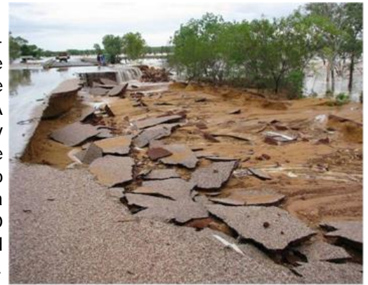
Above: Hardman Creek Bridge washed

All preparations were thrown to the wind after a convoy of 4-wheel drives, filled with teachers and presenters, were confronted with a road closed sign at Wilare Bridge Road House on the way to the Fitzroy Crossing PD on Australia Day. A healthy wet season had washed away stretches of the highway and Hardman Creek Bridge, so for the first time in ten years the PD had to be relocated to Broome. Those who had made it to the Fitzroy Lodge from the other side of the highway enjoyed a spectacular scenic flight into Broome to attend the revised PD location. The PD commenced a day late, but the adaptability and good spirits of all who attended, lead to a successful conference. The low teacher turn-over allowed extension work in Accelerated Literacy and Reading to Learn for returning teachers while the new teachers completed PD1. Thanks to the generosity of Notre Dame University, we were able to use a lecture theatre for combined sessions on Assessment, Mandatory Reporting and training in First Steps Numeracy.