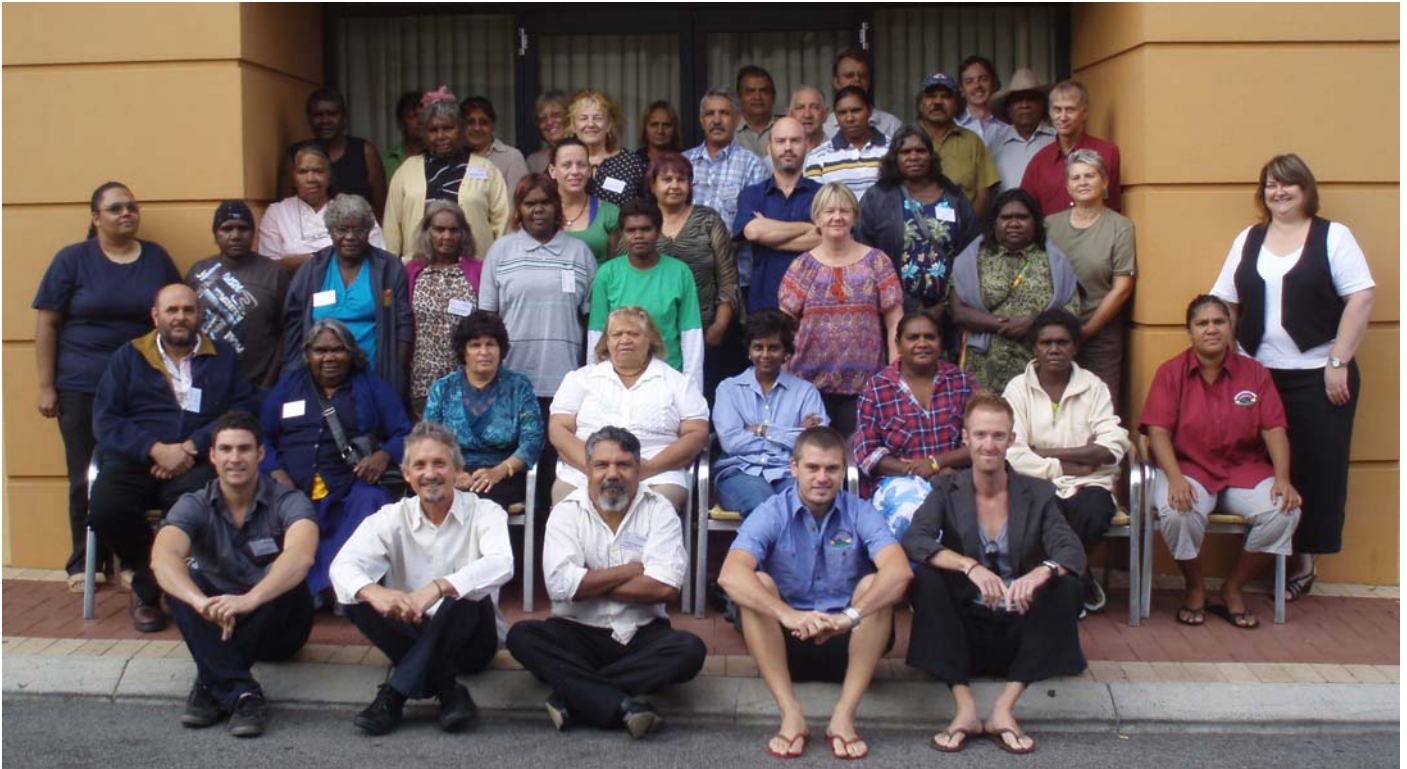
Above: Aboriginal Independent Community School delegates and Support Unit staff pictured outside the venue on the final day of the conference. More pictures inside.

Once again delegates from the 14 Aboriginal Independent Community Schools gathered for their annual conference towards the end of Term 1 this year. The conference presents a great opportunity for schools to share common concerns, interests, innovative ideas and support for the work they do in providing education to Indigenous students around Western Australia, the majority of whom are located in extremely remote, thinly resourced locations.