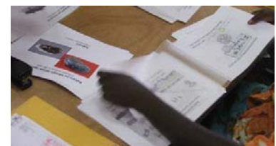
Above: Putting a book together