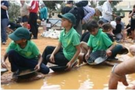
Kurrawang kids panning for gold at Science Rock Fest