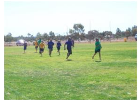
In the lead at Sports carnival