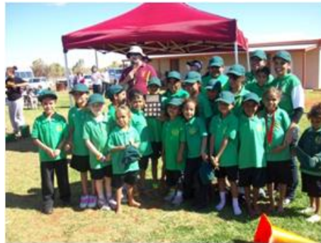
Kurrawang kids victorious at Sports Carnival in