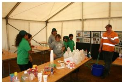
Creating models of erupting volcanoes Stand back everyone!