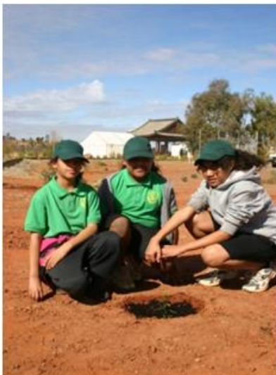
Learning to rehabilitate the land at Science Rock Fest