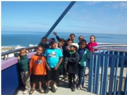
An amazing view