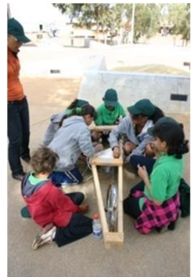
Building a wheelbarrow in the second fastest