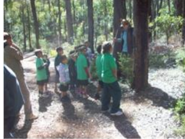
Learning how to Protect and conserve Our forests at Wellington Discovery forest near Bunbury